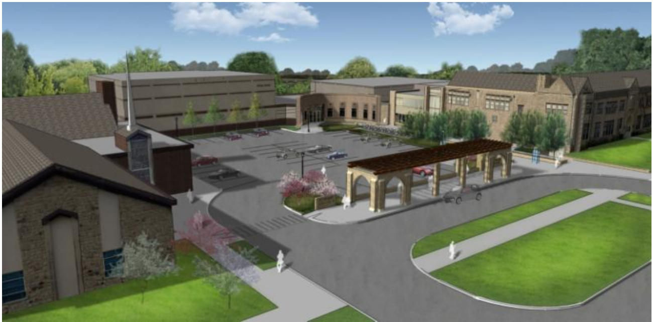
Rendering of student drop off, and parking lot.