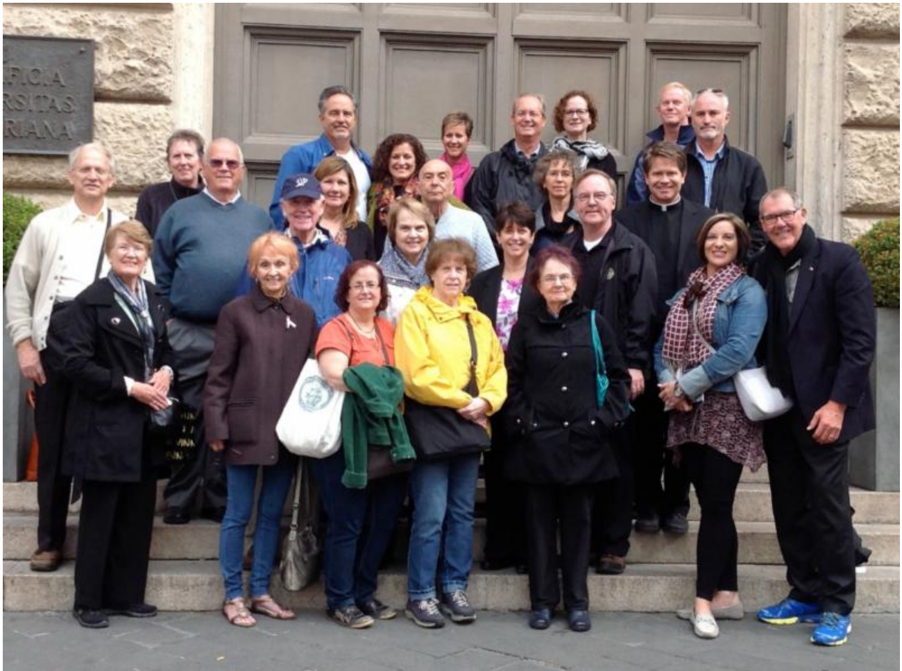
St. Peter's Group In Rome.