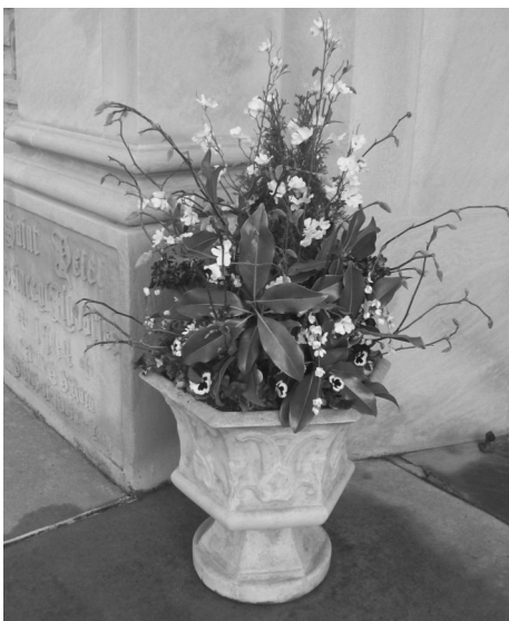
Thanks to those who made the church and surroundings so beautiful for Easter!

Govenor Stumpy's Grill House, 321 East Gregory, is offering $1 from each entrée that is ordered from their special menu to FIRE (Foundation for Inclusive Religious Education). This fundraiser is currently going on and will continue through the month of April. Please let your server know you would like the donation made to F.I.R.E. when you order from the F.I.R.E. menu.